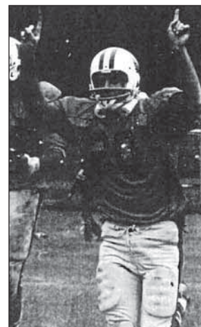
On the field...